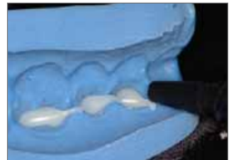
Express the enamel.