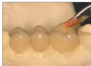
Apply the sealer.