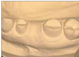
Uniform 1.0 mm reduction.