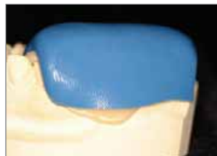
Quickly place the matrix.