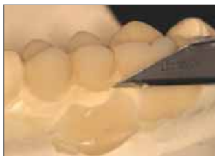
Remove the excess material.