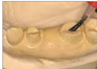
Apply the model separator.