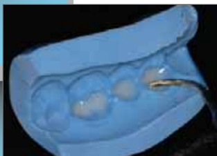
Smooth out the enamel.