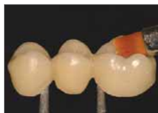
Apply the sealer/glaze and cure.