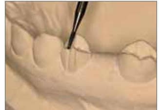
Make depth cuts 1.0 mm.