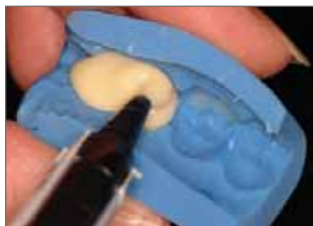
Express the dentin.