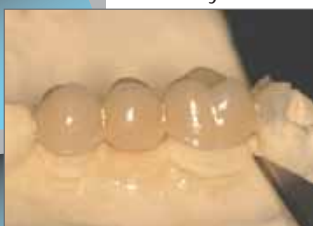
Remove from the model and finish.