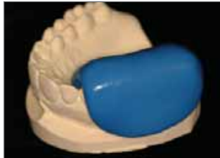
Make a silicone matrix.