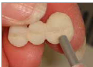
Sandblast to clean.