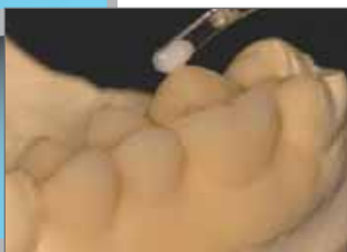
Add on additional material if necessary.