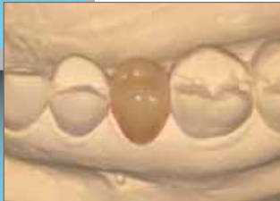
Fill in the edentulous areas.