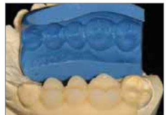
Wait 2 minutes and remove.