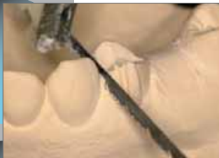
Open the interproximals.