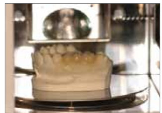
Cure using the correct cycle.