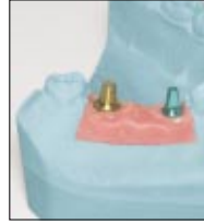
Analog modification complete and ready to fabricate the restoration.