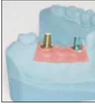
Analog is too tall and needs modification.

Occasionally, the laboratory may determine that modification of the COC Abutment is required to adjust height or buccal/lingual contours. This can be accomplished at this time by using the COC Impression Cap as a reduction coping. This procedure saves clinician one appointment for prepping and re-impressioning.