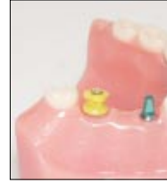
Reduction coping is seated over the abutment in the mouth . Using copious irrigation, Doctor modifies the portion of the abutment that protrudes through the window of the reduction coping.