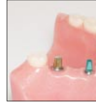
Abutment has been properly modified and is now ready for insertion of the final restoration.

Building Your Practice With LIFECORE Value