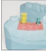
Impression cap seated on working model.