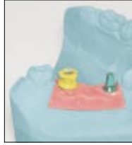
Working model analog is modified using impression cap as a reduction coping.