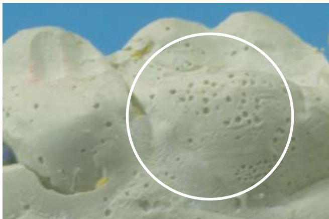
Stone Model with Hydrogen Evolution Voids

Follow manufacturer’s instruction for casting time.