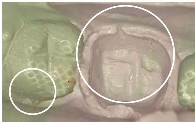
Void Caused by Syringe Technique